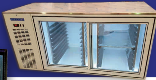
D664 SPECIAL CABINET