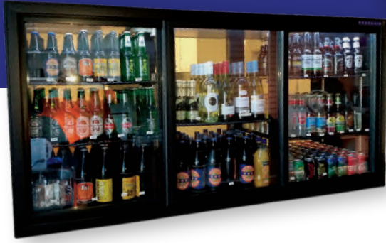
SLIDING 3 DOOR PASS THROUGH